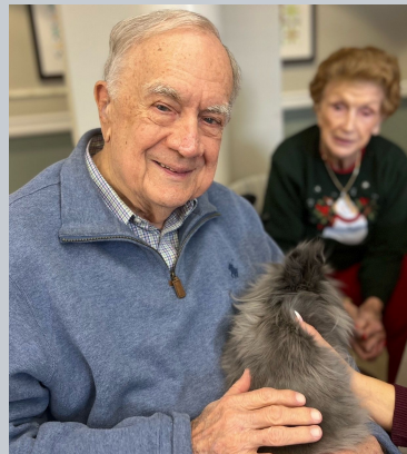
Residents enjoyed a morning of much-needed "pet therapy," with a visit from Bugz Bunny Rescue.