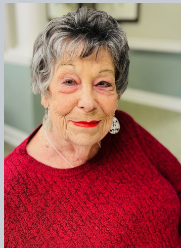
Residents and staff wore "RED," to show our love and support to the American Heart Association. February is HEART month!